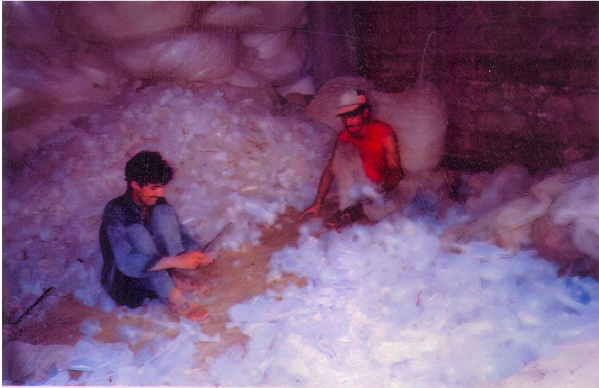
Purchasing of plastic waste by middle dealer