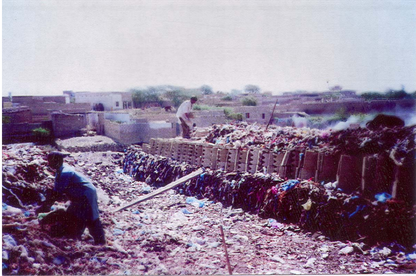
Waste disposal in squatter settlements