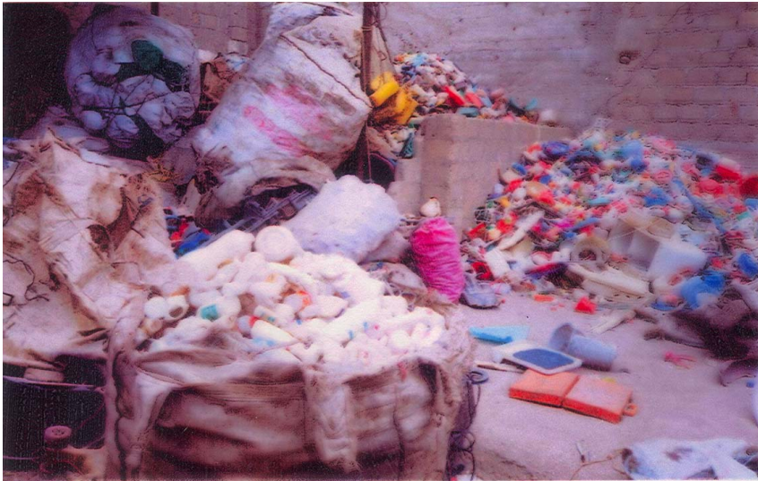
Plastic items separated for selling