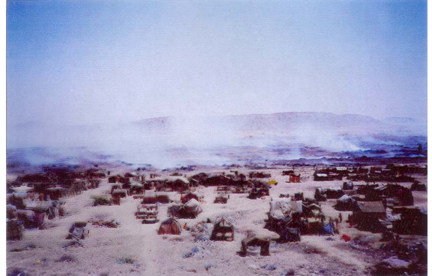
Scavenger's colony at Jam Chakro