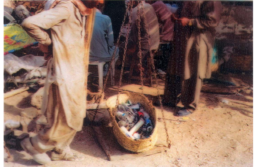
Purchasing of metal waste by middle dealer