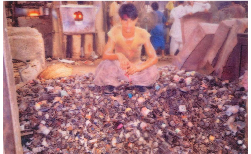
Glass bottles separated for selling